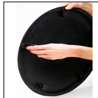
Screw glides into bottom of base.