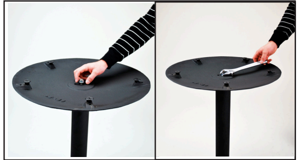
Connect base to column by tightening nut. Flip over for finished product