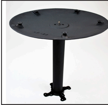
Step 4 Continued