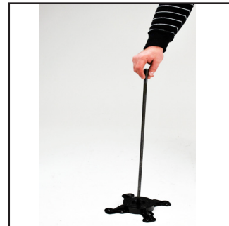
Flip spider and rod upside down, threaded end of rod should face up.