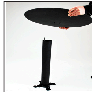
Flip base upside down and guide rod through base's center hole